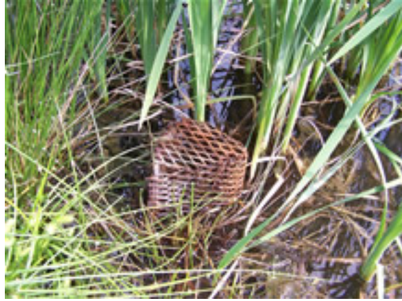
Water Outlet with Trash Guard (Overflow pipe or primary spillway)

Prepared by Melanie Barkley, Extension Educator in Bedford County.